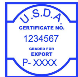
(Impression of Export Stamp - in Blue ink)

Shipping container sealed with Seal Number _____.